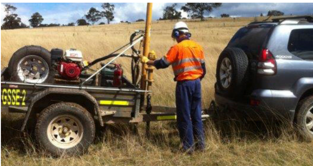
Soil sampling undertaken to inform the Gateway assesment