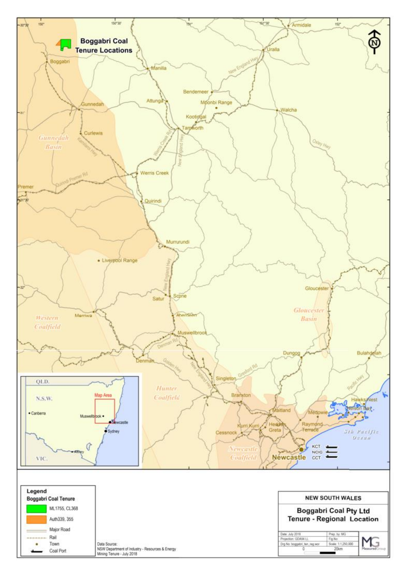
Figure 5.1: Location of Boggabri Coal Project A339